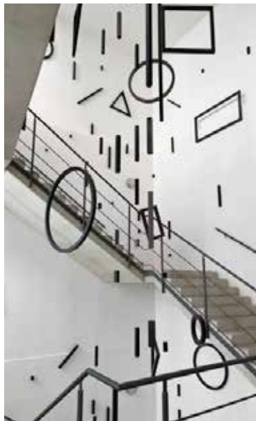
Gestalt , 2011 installation, Künstlerhaus Hannover