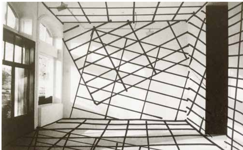
Preparatory image for the exhibition Linear Approximation in La BF15

with the support of the Austrian Cultural Forum in partnership with Gerflor and ParisART